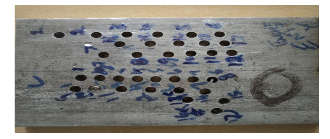
Figure 1: Drilled stainless steel plate.

The factors considered for this work were drill spindle speed and feed rate. The ranges for spindle speeds are 270, 350 and 540 rpm. Feed rate ranges are 0.038, 0.076 and 0.023.